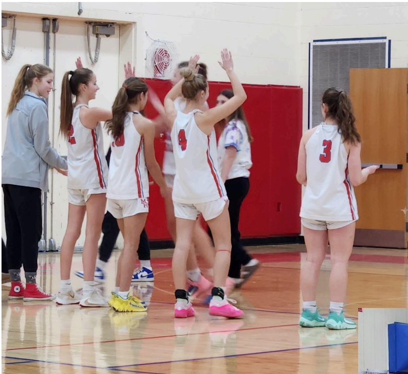
Pregame introductions get the team psyched up!