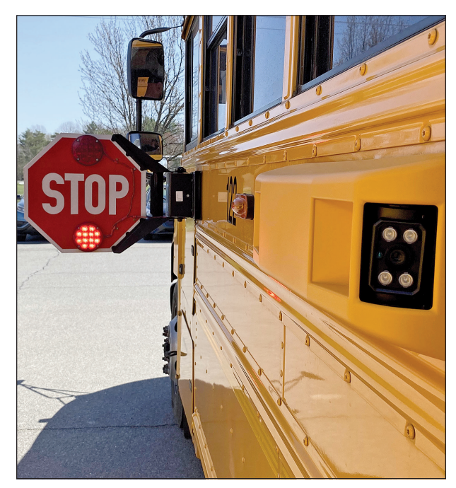
Stop Arm Camera on Schodack Buses

Parents/guardians are also encouraged to download the STOPit app and search for your student's school using the directory. They can privately ask for help for their student, a family member or any Schodack student they feel may need help. More information about STOPit is on the district website at www.schodack.k12.ny.us/stopit-anonymous-reporting/