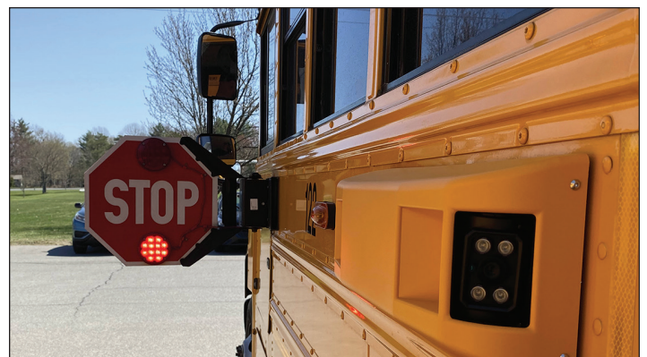
Stop arm camera on Schodack bus.

Mr. Chevrier added, "we're doing everything we can on our part to ensure those students are as safe as possible at the start and end of their school day. Hopefully, it encourages the drivers sharing the roads with our buses to do their part as well."