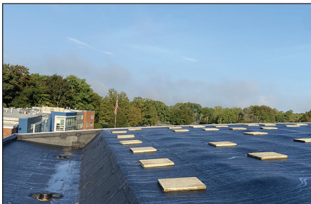
Gym roof before replacement.

Voters approved this capital project the same day they approved the 2022-2023 Budget. Work will cover necessary maintenance, renovations and improvements at all primary district sites (Castleton Elementary, Maple Hill Jr./Sr. High School, the District Office and the Bus Garage). Site work for this project will start soon and be broken into two phases. Phase 1 construction is scheduled to begin this May and is expected to be completed in 2023. It will include site work at Maple Hill Jr./Sr. High School, the District Office building and Castleton Elementary. We will inform district families if there is any anticipated impact on Summer 2023 programming. Phase 2 construction will begin at a to-be-determined time in 2024 and is expected to be completed within that same year. It will include the remaining site work at Maple Hill Jr./Sr. High School, Castleton Elementary, the District Office and the Bus Garage. For more information about specific improvements included in this project visit www.schodack.k12.ny.us .