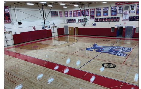
Refinished gym floor.