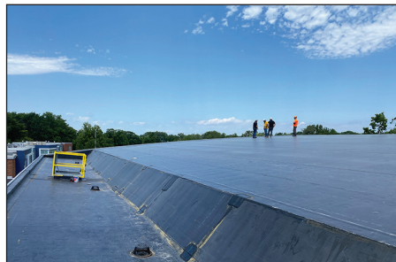
Gym roof after replacement.