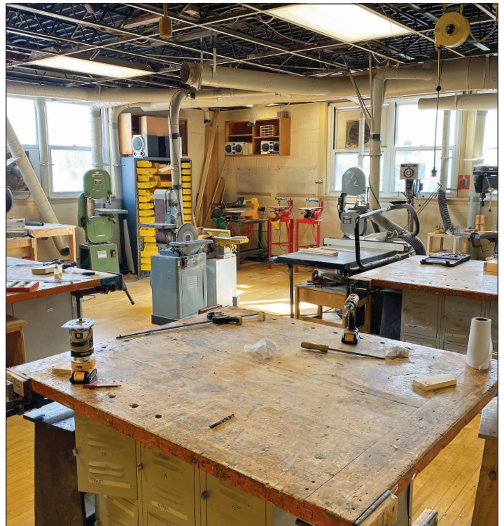
Current MH Technology Suite