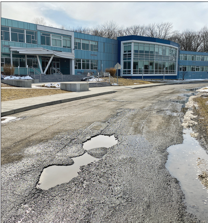
Current MH Parking Lot