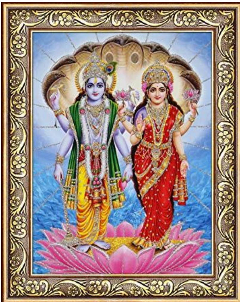
Lord Vishnu and his wife