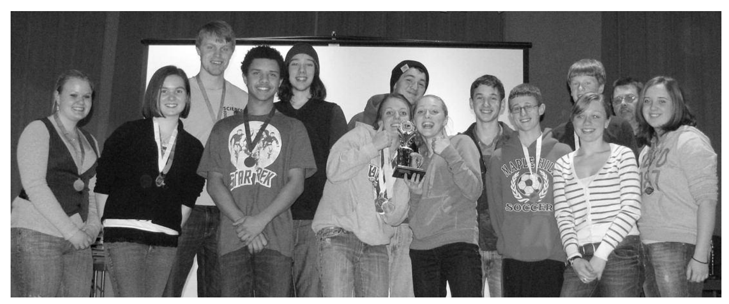
MHHS students qualified for the state Science Olympiad Competition this year after their performance at the regional competition, where they finished first in two events and in the top five in eight other events.