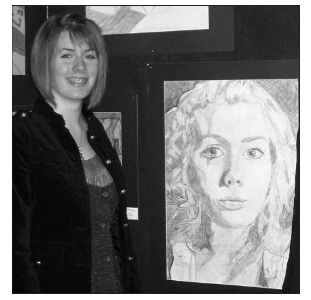
Schodack students had their artwork selected for numerous art shows this year, including the NYS Art Teachers Legislative Student Exhibit, the High School Art Invitational Exhibit at HVCC & the High School Regional Art Exhibit at Proctor's Theatre.