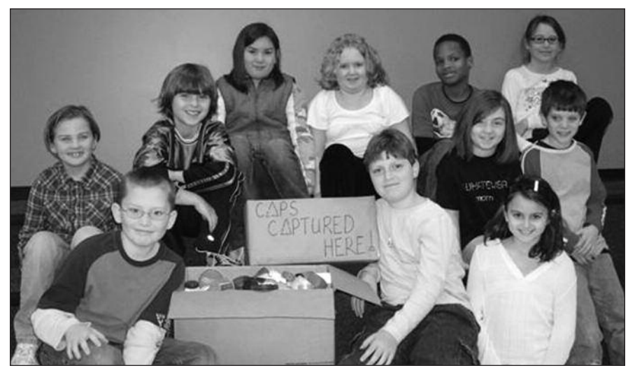
Schodack students help out the district's recycling program which is both environmentally friendly and saves money. This year, students expanded the program by collecting plastic bottle caps.