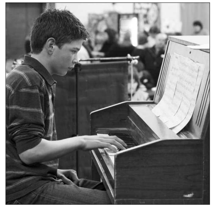
A MHMS student performs at this year's International Dessert Night which was attended by hundreds of community members.